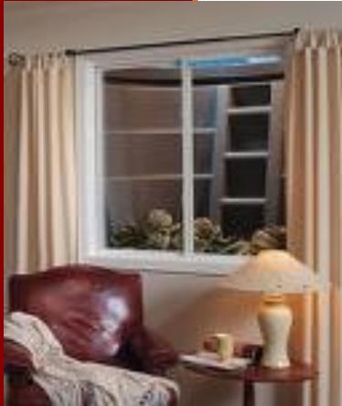
Egress must be clear to allow escape in the event of fire.